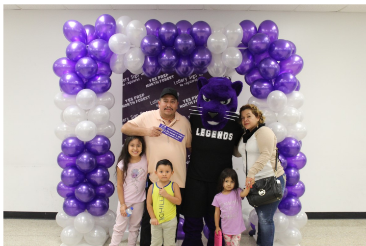
Families who registered for the Lottery last year.